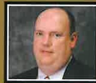
JAMES R. ANGELL